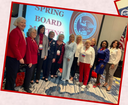
NFRW Spring Board Meeting