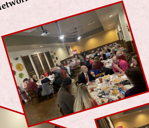
Speed Meeting for the Candidates Hosted by CCRW and Republican Network of Galveston County