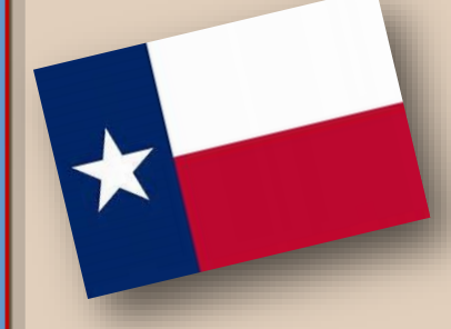
December 7, 2018 General Meeting