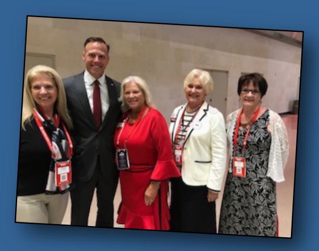
CCRW ladies at 2018 RPT Convention with Railroad Commissioner Ryan Sitton